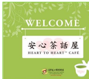
Heart to Heart® Café Poster