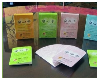
Heart to Heart® Cards