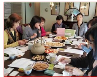
Heart to Heart® Café using Heart to Heart Cards

The Archstone Foundation Award for Excellence in Program Innovation is an annual award, established in 1997 through an endowment, to recognize best practice models in the field of aging and public health. By providing national recognition to these programs, Archstone Foundation hopes that it will enable these model programs to be replicated, and to continue to be evaluated in an effort to enhance innovative services for older adults throughout the U.S. To read more about HTH Café, click to download APHA and Archstone Foundation's 2023 Award Brochure .